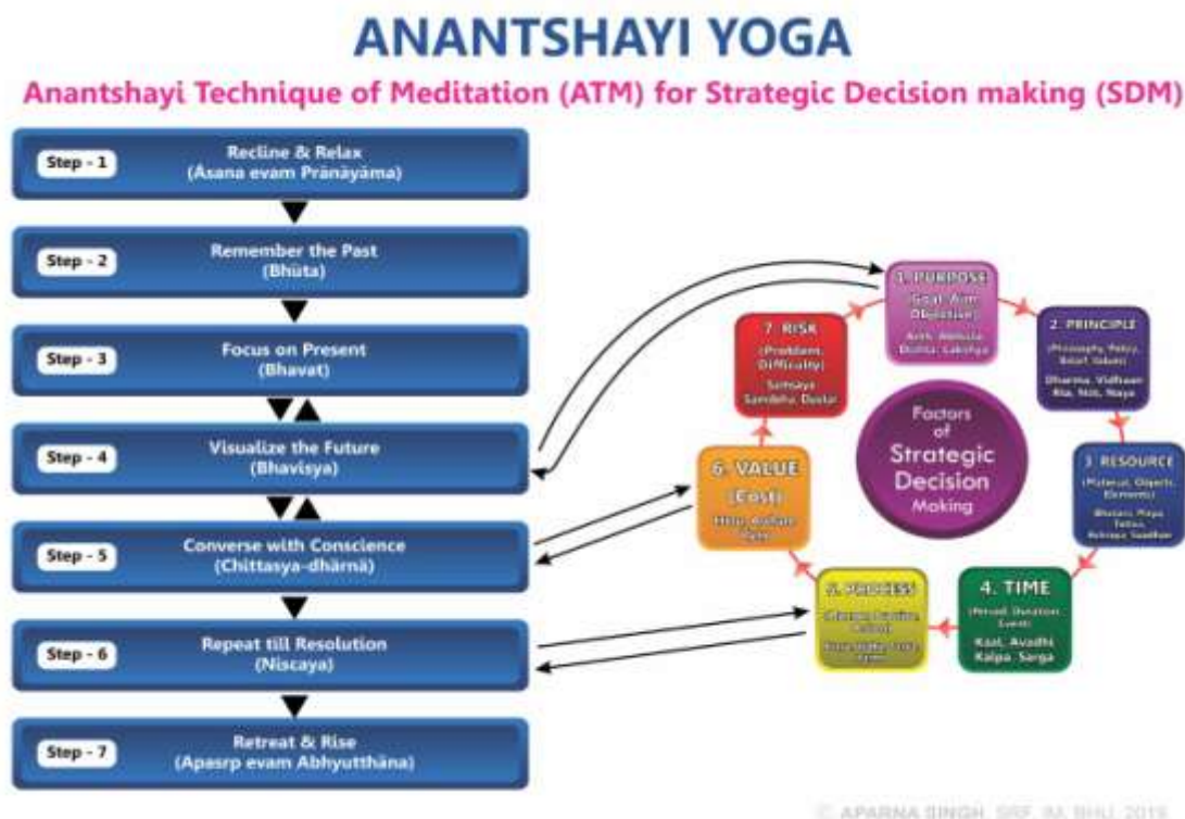
Figure 1. The Step-by-Step Process of Anantshayi Meditation Technique (ATM) for Strategic Decision Making (SDM)

This is the conceptual model of the ‘Anantshayi Technique of Meditation’ (ATM) that was introduced during the ‘Yoga and Meditation Workshop’ before the Participants. It was fully demonstrated to them and they were asked to repeat it several times during the sessions, so that they get well-versed in its practice. This ATM Intervention was used for a Pre-Test and Post-Test Research during a 6 weeks non-residential program. After 6-weeks same set of participants were again contacted for their Post-test Feedback.