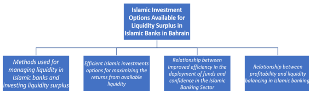
Figure 2: Conceptual Framework

As Islamic Banks do not have the right to sell their debts higher than their minimal determine cost, as well as their assets, remain to be the subject of the time till they can repay their debts. Thus, Islamic banks face difficulties in managing their liquidity with respect to focus on investment option. One of the major challenges faced by Islamic bank with respect of liquidity is related to maintenance of balance among assets and liabilities. Due to the availability of excess liquidity, Islamic banks fail to generate or use profitable investment opportunities that directly affect revenue generated by banks and profits on the return for depositors (Iqbal & Molyneux, 2016). In this regard, the below conceptual framework will facilitate assistance in identifying prevailing issues in liquidity surplus management practices of Islamic Banks in the Kingdom of Bahrain through the themes as mentioned below.