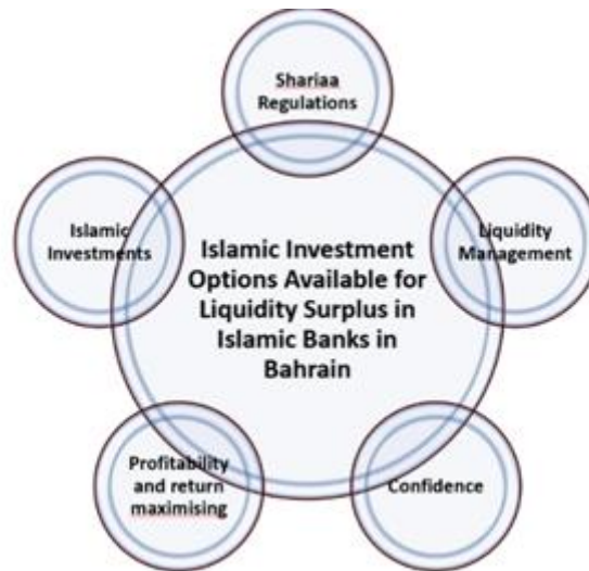
Figure 1: Theoretical Framework

The theoretical and conceptual framework of this review is aimed at structuring a descriptive structure following which research aims and objectives can be achieved in an appropriate manner. This research framework has divided the central theme of the research into four subjective themes that will help conduct an in-depth empirical study of the selected research topic. As the research aims towards analyzing the practices of liquidity risk management that are applied in the Islamic Banking sector in the Kingdom of Bahrain; thus, it is the central theme of the conducted literature review.