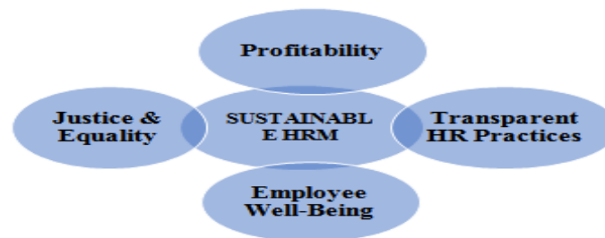
Exhibit 2 Dimensions of sustainable HRM

Exhibit 2 shows the integrated relationships of four dimensions of sustainable HRM. All these show a shift toward an employee-centred perspective of people management. Respect for humanity is said to be future direction of HRM (Cleveland et al. 2015).