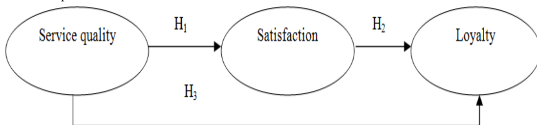
Figure 1 Research model

From the description above can be described the research model as follows: