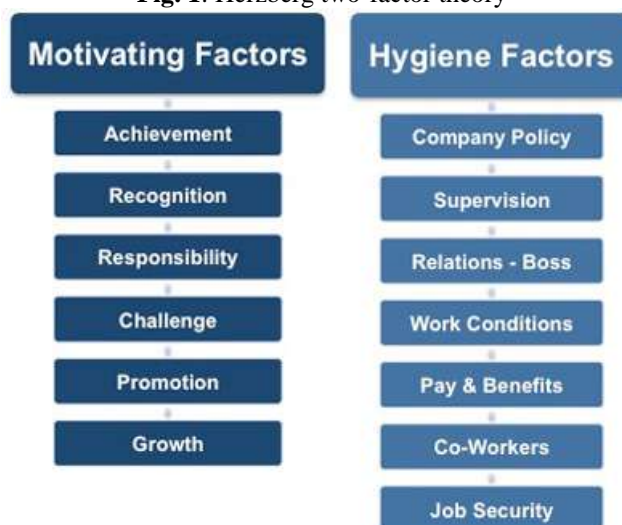
Fig. 1: Herzberg two-factor theory

The study used Herzberg two-factor theory to facilitate the identification of factors that caused high, medium and low satisfaction.