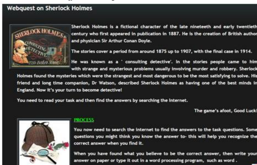
Figure 1. WebQuest Introduction Section

Firstly, they had to follow the links and searched for information about Sir Arthur Conan Doyle, the author of the story, and his main character, Sherlock Holmes ( http://sherlock-holmes.classic-literature.co.uk/a-scandal-in-bohemia/ ). Afterward, they accessed the story and the worksheet.