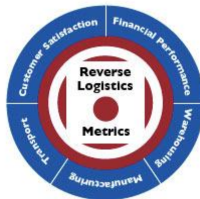
Figure 1: Sectors of Reverse Logistics Performance Indicators Source: http://www.rlmagazine.com/edition11p50.php

Reverse Logistic Association identifies and defines the sectors of Reverse Logistics Performance Indicators, which can be used for measuring the performance of reverse logistic supply chain. These sectors are: Customer Satisfaction, Financial Performance, Internal Business Process Perspective, Warehousing, and Transport. (figure1). For each of these sectors Performance Indicators are selected and presented in table 1.