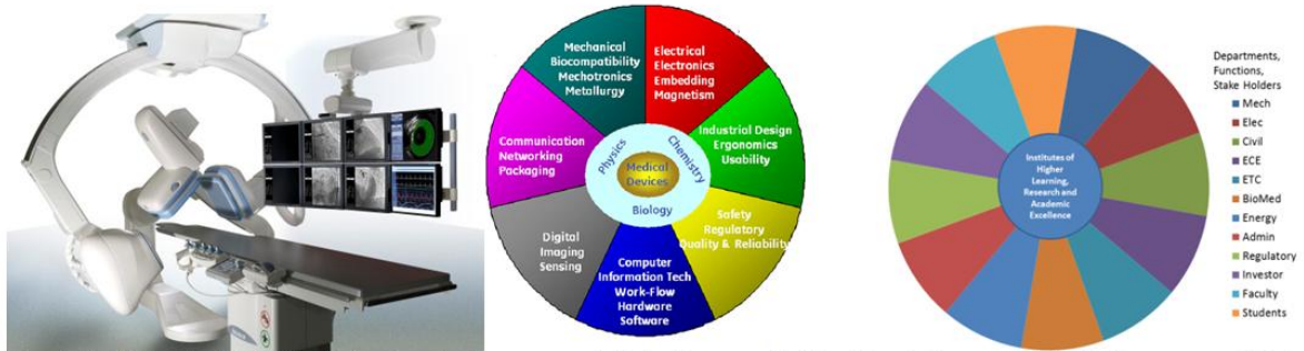
Fig.1 & 2 Typical Medical Device & System and Sub-System [15] Fig. 3 System & Sub-Systems of EEE

DMAIC as briefed in [7] is the process improvement methodology of Six Sigma approach either at the system level or at the component / task level for the product or process Industry. It shall be of benefit in explaining the model and frame work with an example of a product and apply the analogy to EEE for system level approach.Fig.1 captures one of the highly sophisticated, highly safety critical medical device from GE [15] used ininterventional diagnostics and also in procedure like stenting in coronary artery of the heart. The medical device as a system [Fig. 1], integrates various sub-systems [Fig. 2] by leveraging cutting edge technology across various domains of engineering [15] in delivering the flaw less function to the Doctors and patients. We can extend the same analogy of the System approach to EEE, which has to integrate with various sub-systems of like various Departments of Academic Excellences, various departments of Administrative functions and various external agencies like regulatory authorities, investors (parents), society etc. in delivering a flawless service and outputs from EEE. Fig. 3 covers a broader System and Sub-System involvement to an EEE and can be extended / expanded / modified according to the structure and discipline of EEE.