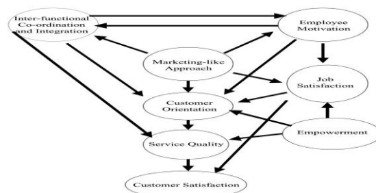
Figure 2: A model on internal marketing; Source: [7]

Rafiq and Ahmed [7] present a model of internal marketing which was in alignment with all the parameters of their above stated definition on internal marketing: