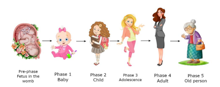
Figure 3. The lifecycle of human life

Human life goes through different phases. It originates in the mother, who carries the baby for 9 months until the moment of its birth. From this moment the first phase of life begins. Human existence goes through five phases, as can be seen in Figure 3.