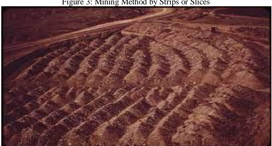
Figure 3: Mining Method by Strips or Slices

- Mining in Strips or Slices: it is most applied in tabular deposits or with horizontal layers with little capping thickness. It provides a large production scale, providing even lower operating costs and greater productivity than bench mining.